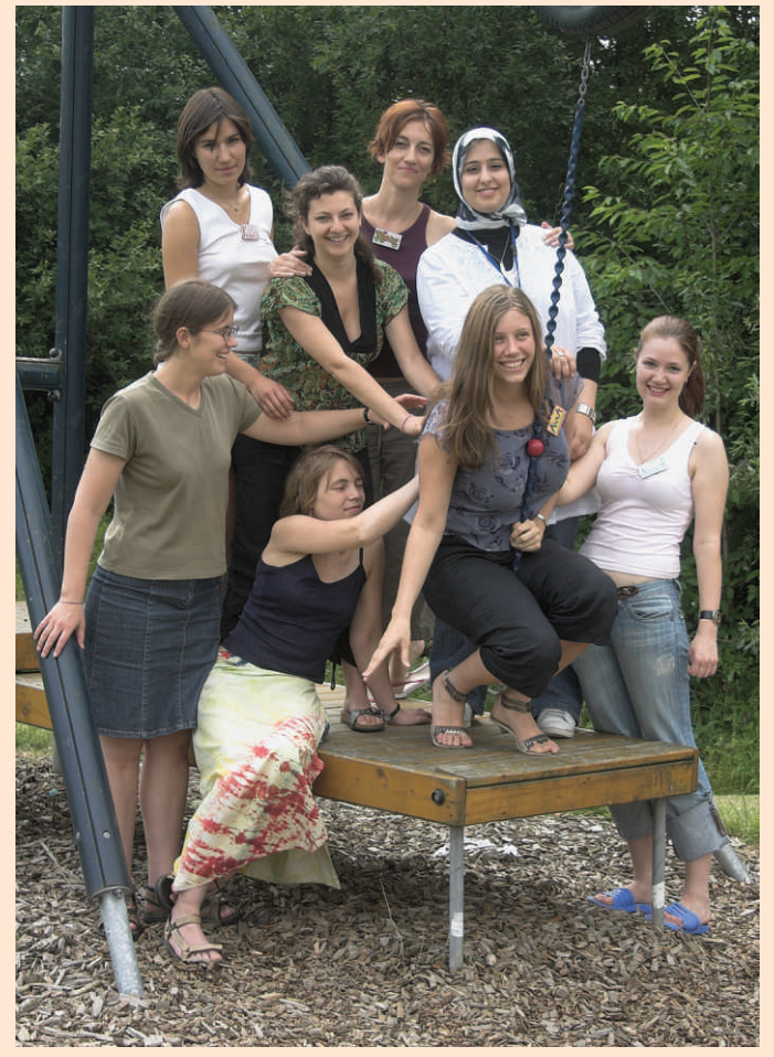
The workshops were run with the help of International volunteers from Russia, France, Sweden, Czech Republic, Poland and Italy.