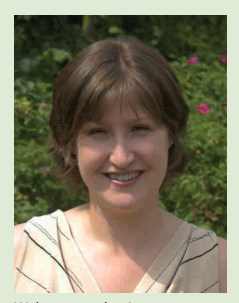
Welcome to the Autumn edition of Peace Talks.

In this issue you will see we are focusing on the many relationships we have been developing within the Corporate Sector and highlighting some of their efforts to fundraise to support our work.