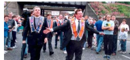
David Trimble - Drumcree 1996