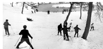
Ulster under snow

essionally designed and ordable Websites