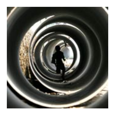
A selection of the best images from around the world